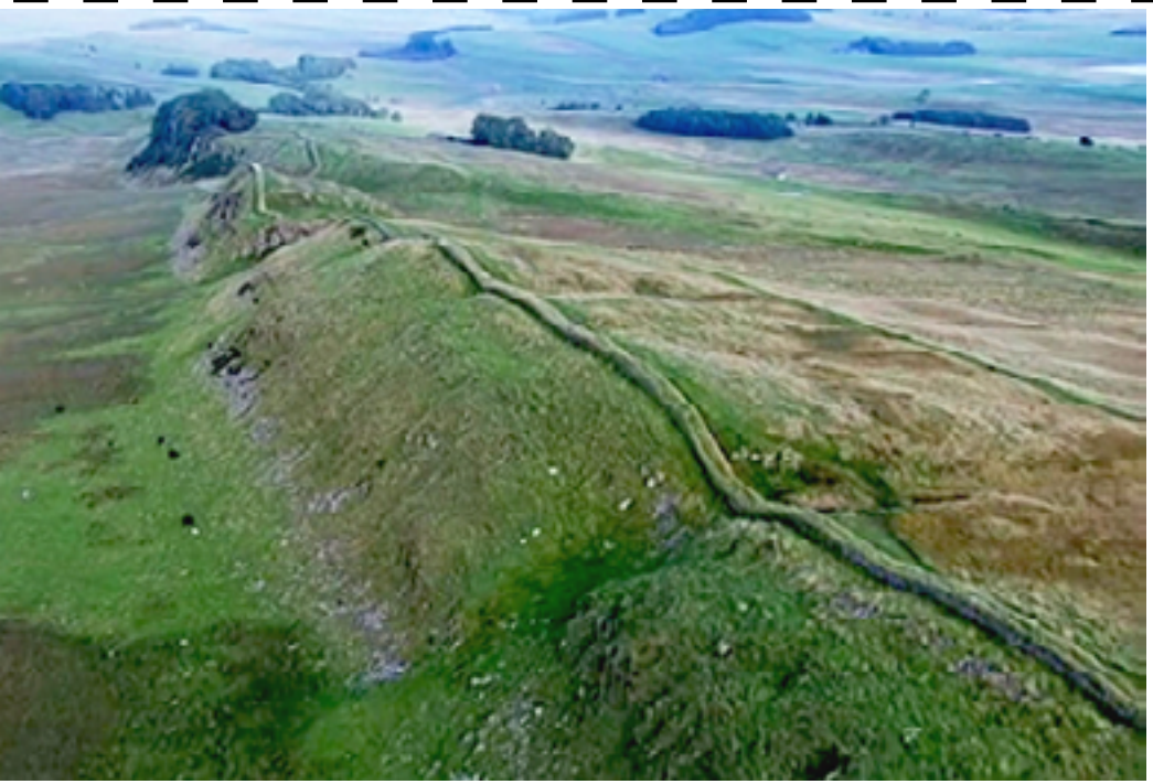
http://www.collaborative learning.org/seen from above.pdf