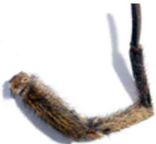
one hairy spider leg