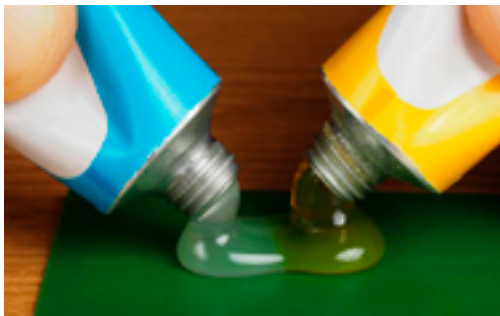
tubes of glue