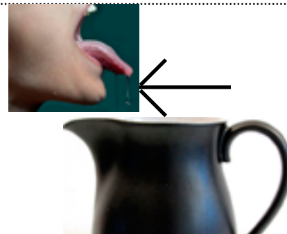
jug of spit